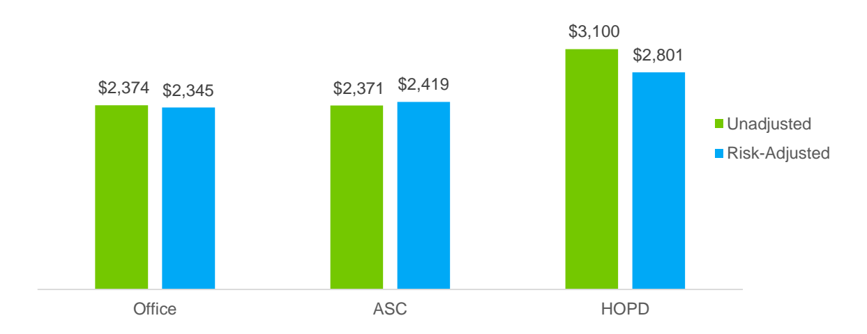
Figure 4. Average Payment Per 61-Day Colonoscopy Episodes

Note: 95% confidence intervals of estimated average unadjusted and risk adjusted payments not shown in Figure 4.