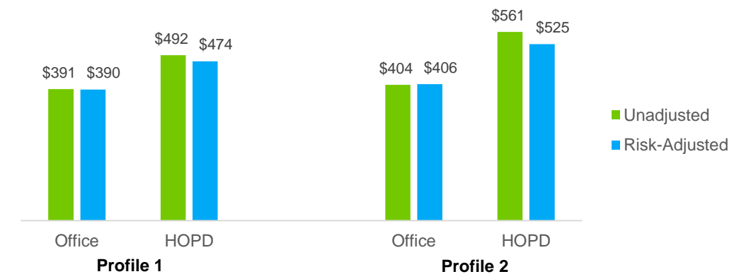
Figure 3. Average 7 Day Episode Payments for E&M Profiles 1 and 2

Notes: 95% confidence intervals of estimated average unadjusted and risk adjusted payments not shown in Figure 3. Excludes top 0.5% of outliers.